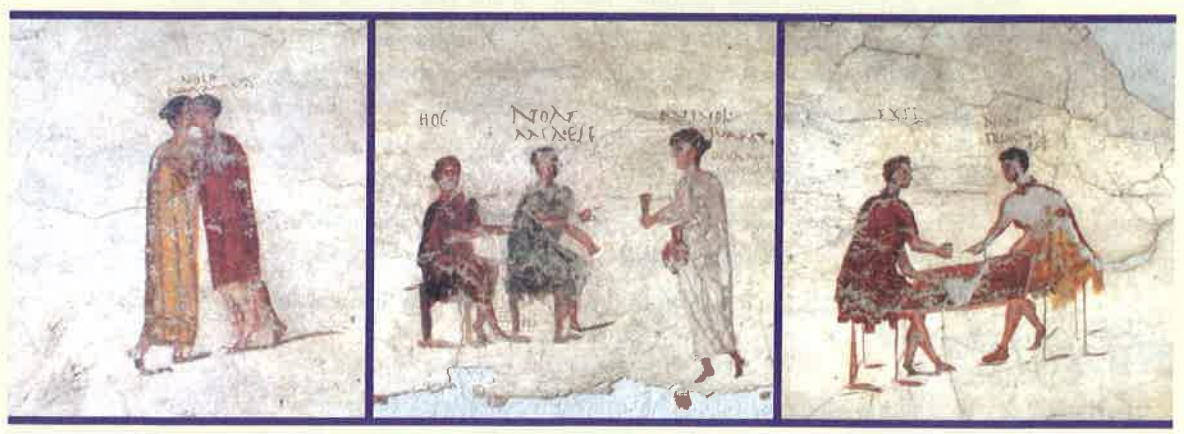
Museo Archeologico Nazionale, Naples, Italy