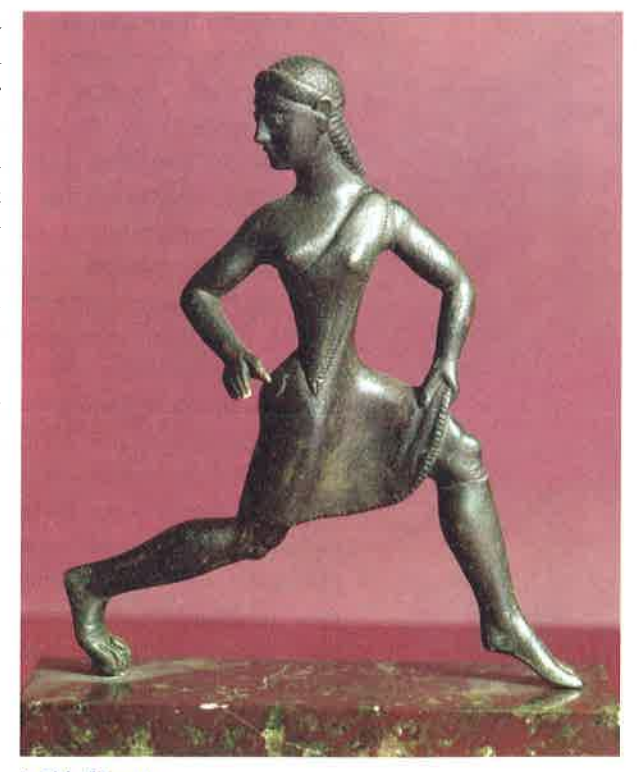
A Girl of Sparta This figurine portrays a young female Spartan athlete or runner. Compare her clothing with that worn by Hegeso in the photo opposite.

This militaristic and far-from-democratic system had implications for women that, strangely enough, offered them greater freedoms and fewer restrictions. As in many warrior societies, their central task was reproduction—bearing warrior sons for Sparta. To strengthen their bodies for childbearing, girls were encouraged to take part in sporting events—running, wrestling, throwing the discus and javelin,