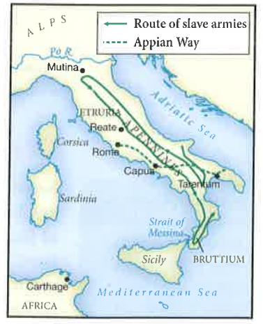
The Rebellion of Spartacus

Know examples of slave rebellions and their effects.