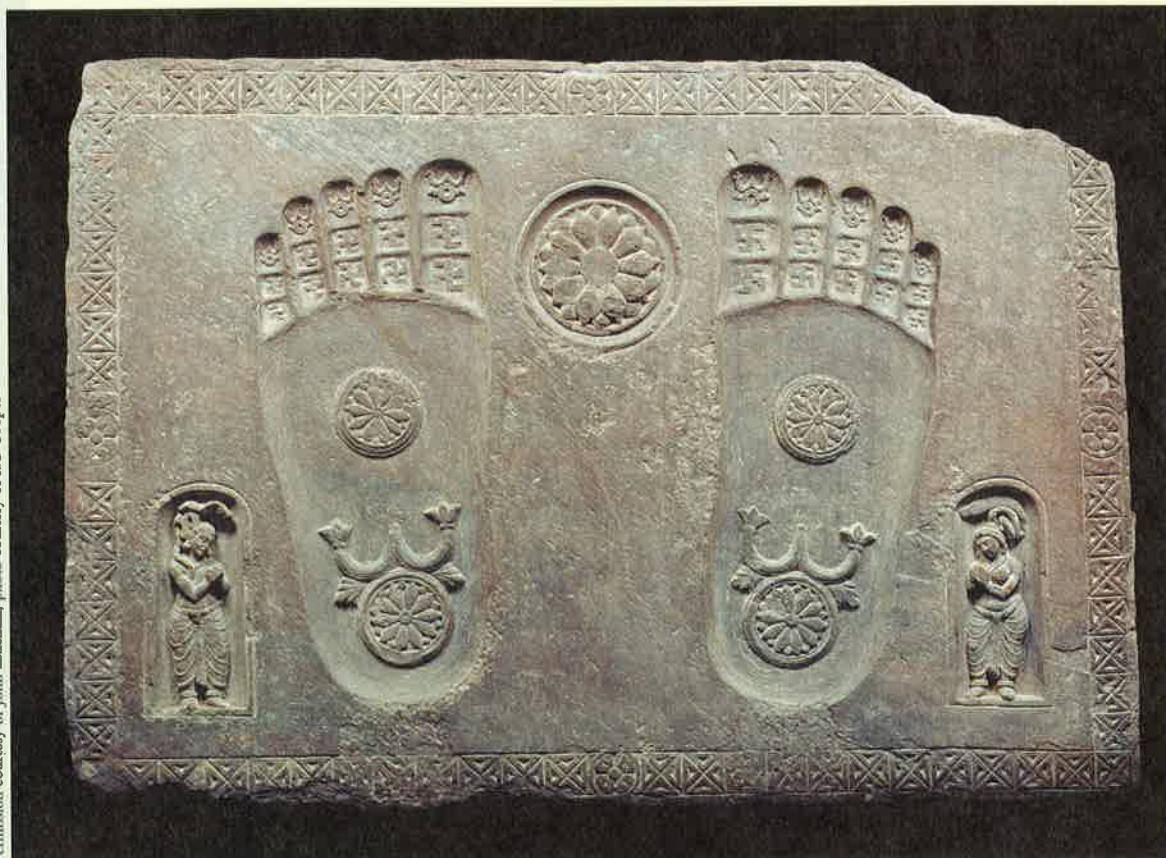
Source 4.1 Footprints of the Buddha

Source 4.1 shows a footprint image from northwestern India dating probably from the second century C.E. and containing a number of Buddhist symbols. In the center of each footprint is a dharmachakra , a wheel-like structure that had long symbolized the Buddha's teaching. Here, it surrounds a lotus flower, representing the Buddha's purity. Near the heel is a three-pronged emblem known as a triratna . It symbolizes the three things in which Buddhists can take refuge: the Buddha himself, his teaching, and the sangha (the Buddhist community). This particular footprint image also includes in the bottom corners two yakshis , Indian female earth spirits suggesting fertility. The position of their hands conveys a respectful greeting.