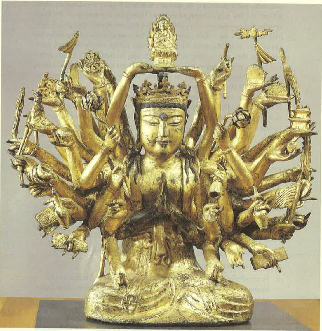
Source 4.3 A Bodhisattva of Compassion: Avalokitesvara with a Thousand Arms

Gilded wooden statue from the Temple of Tongbong-Sa, South Korea, Goryeo Dynasty, 10th–11th century/ Gianni Dagli Orti/DeA Picture Library/The Granger Collection, NYC — All rights reserved.