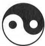
The Yin Yang Symbol

Thus a scholar-official might pursue the Confucian project of “government by goodness” during the day, but upon returning home in the evening or following his retirement, he might well behave in a more Daoist fashion—pursuing the simple life, reading Daoist philosophy, practicing Daoist meditation and breathing exercises, or enjoying landscape paintings in which tiny human figures are dwarfed by the vast peaks and valleys of the natural world (see image on page 155). Daoism also shaped the culture of ordinary people as it entered popular religion. This kind of Daoism sought to tap the power of the dao for practical uses and came to include magic, fortune-telling, and the search for immortality. It also on occasion provided an ideology for peasant uprisings, such as the Yellow Turban Rebellion (184–204 C.E.), which imagined a utopian society without the oppression of governments and landlords (see Chapter 5, pages 197–98). In its many and varied forms, Daoism, like Confucianism, became an enduring element of the Chinese cultural tradition.