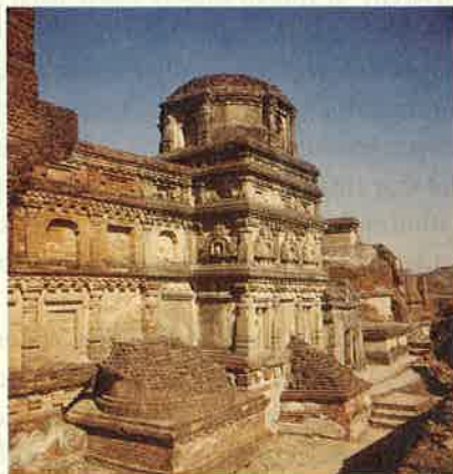
One of the many temples in the Nalanda complex.

Patronized by the emperors of India's Gupta dynasty and later rulers, Nalanda was supported by the dedicated revenue from 100 or more villages in the region and operated under state supervision. Students, numbering in the many thousands, lived in dormitories and were taught by hundreds of instructors. Scholars and students alike came to Nalanda from all over the Buddhist world and