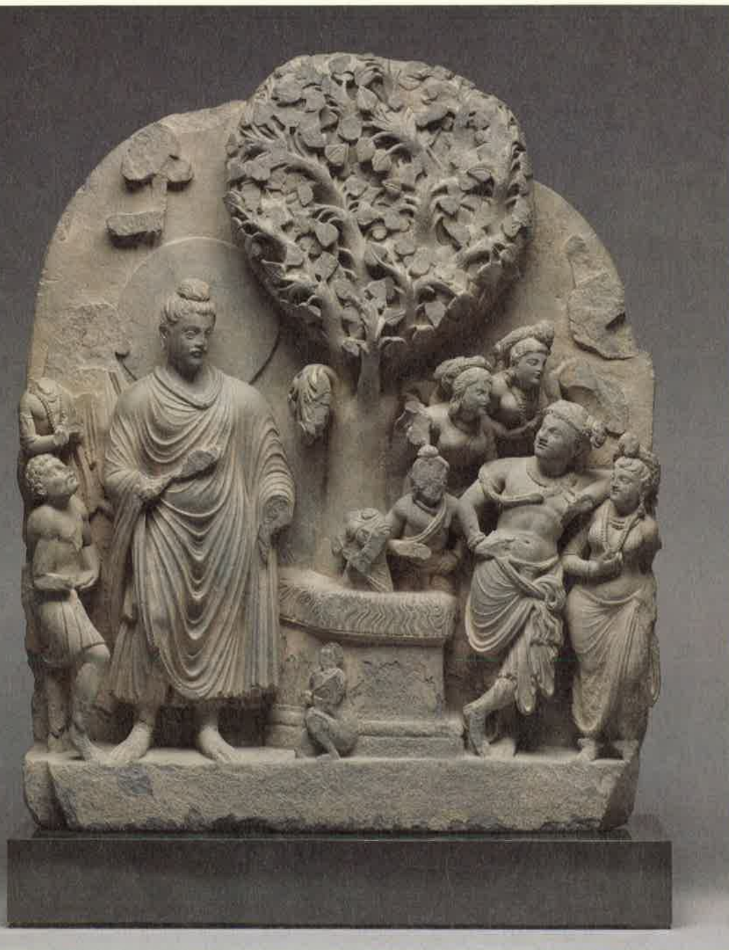
Source 4.2 A Gandhara Buddha

Siddhartha at the Bodhi Tree, 100–200 A.D. (stone), Indian. School