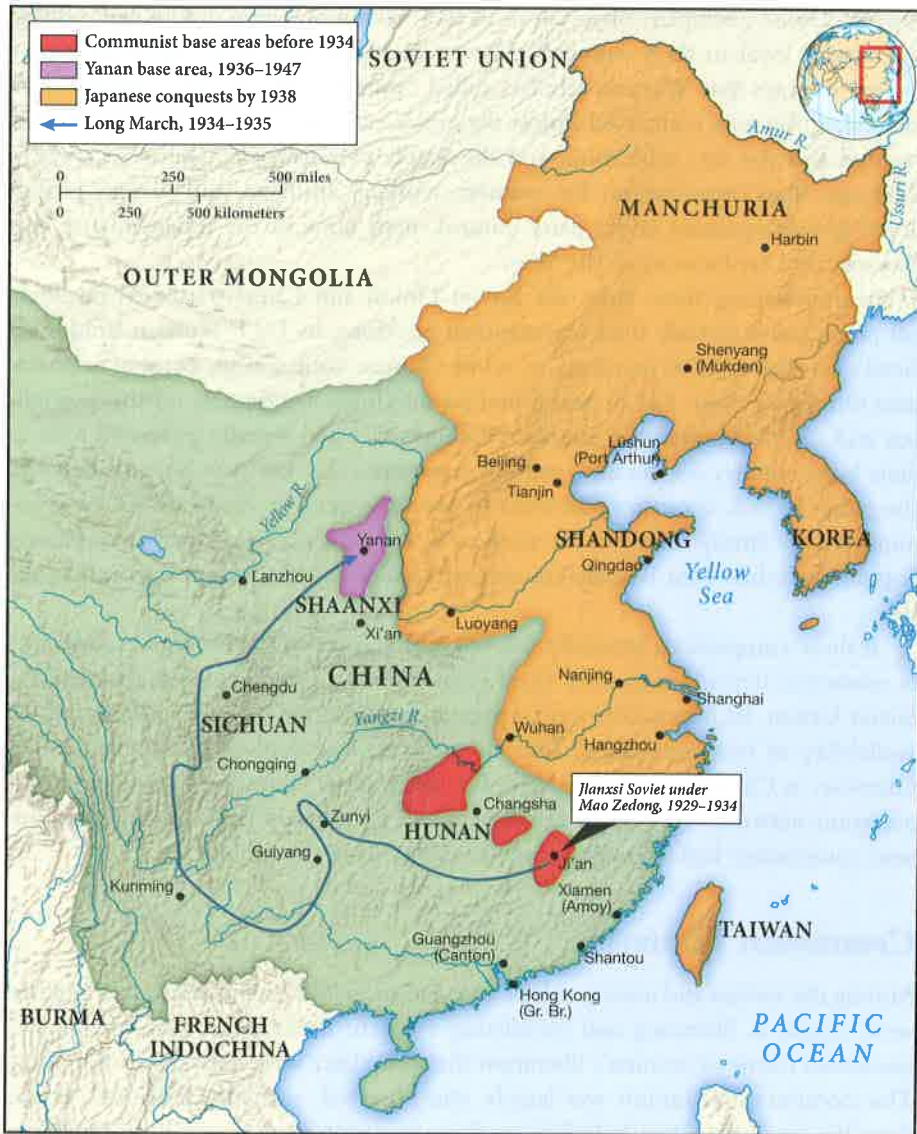
Map 21.2 The Rise of Communism in China

Communism arose in China at the same time as the country was engaged in a terrible war with Japan and in the context of a civil war with Guomindang forces.