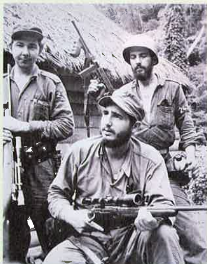
Fidel Castro fighting in the mountains of Cuba in 1957.

The armed revolt began disastrously. In 1953, the Cuban army defeated Castro and 123 of his supporters