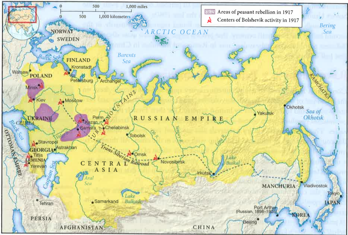
Map 21.1 Russia in 1917

In 1917 during the First World War, the world's largest state, bridging both Europe and Asia, exploded in revolution. The Russian Revolution brought to power the twentieth century's first communist government and launched an international communist movement that eventually incorporated about one-third of the world's people.