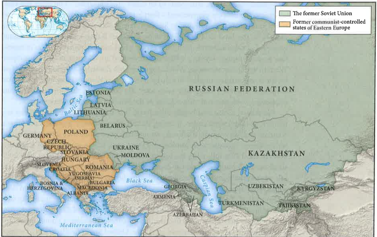
Map 21.4 The Collapse of the Soviet Empire

Soviet control over its Eastern European dependencies vanished as those countries threw off their communist governments in 1989. Then, in 1991, the Soviet Union itself disintegrated into fifteen separate states, none of them governed by communist parties.