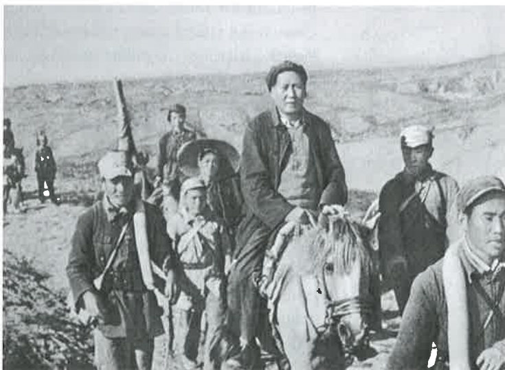
Mao Zedong and the Long March

You need to know ways that communism in China differed from communism in Russia.