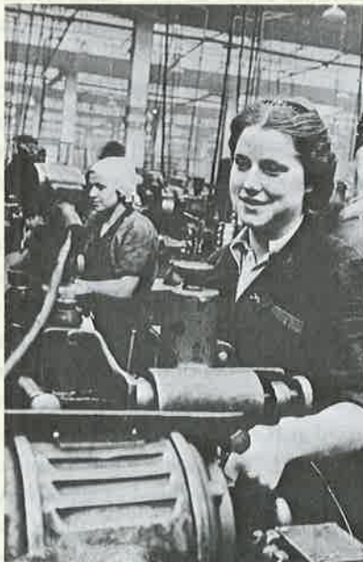
A 1941 image of a woman factory worker in Moscow.