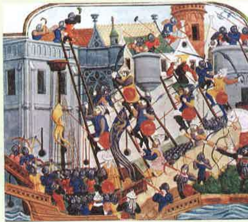
Ottoman Turks storm the walls of Constantinople in 1453.

Constantine XI, the last Byzantine emperor, was well aware of the odds he faced. Yet his great city, protected by water on two sides and a great wall on a third, had repeatedly withstood many attacks and sieges. Furthermore, until the very end, he had hoped for assistance