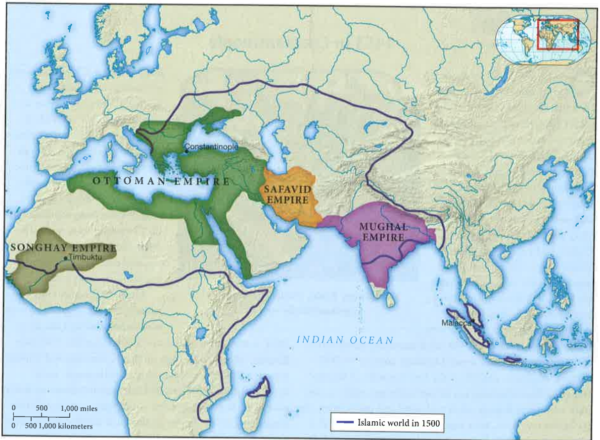
Map 12.4 Empires of the Islamic World

The most prominent political features of the vast Islamic world in the fifteenth and sixteenth centuries were four large states: the Songhay, Ottoman, Safavid, and Mughal empires.