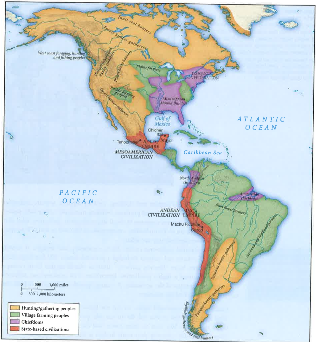
Map 12.5 The Americas in the Fifteenth Century

The Americas before Columbus represented a world almost completely separate from Afro-Eurasia. It featured similar kinds of societies, though with a different balance among them, but it largely lacked the pastoral economies that were so important in the Eastern Hemisphere.