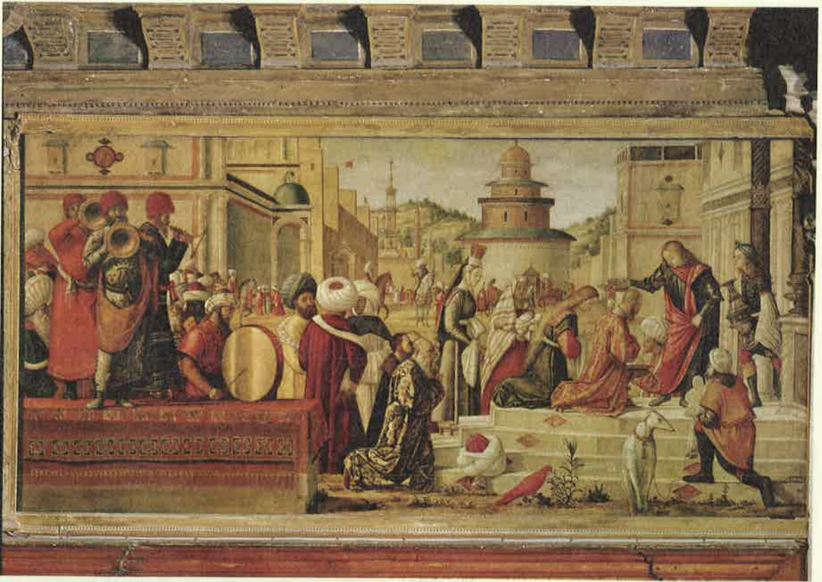
Source 12.4 Saint George Baptizes the Pagans of Jerusalem

By Vittore Carpaccio (ca. 1460–1523), 1501–1507/Scuola di San Giorgio degli Schiavoni, Venice, Italy/Giraudon/Heritage Images