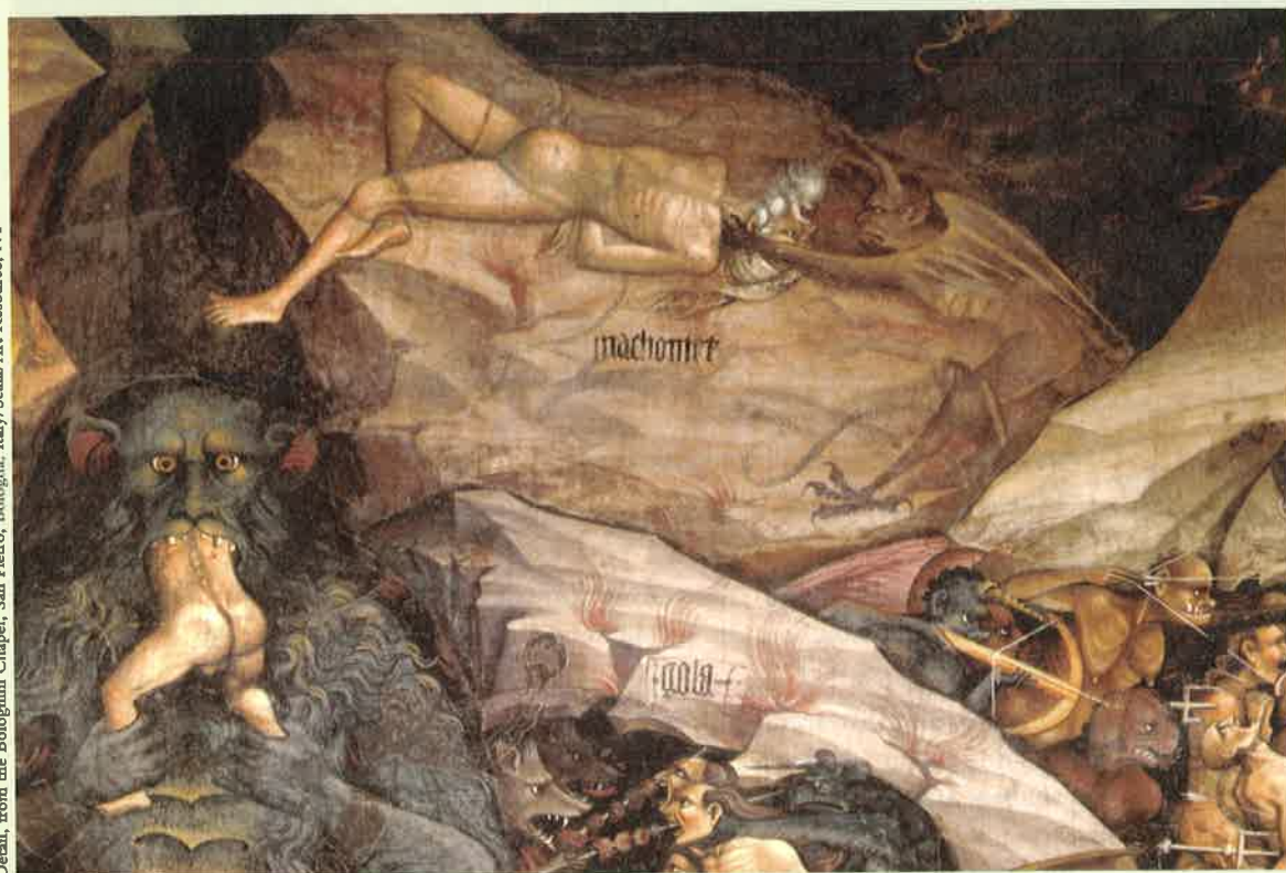
Detail, from the Bolognini Chapel, San Piero, Bologna, Italy

The most infamous Renaissance example of hostility to Islam as a religion is displayed in Source 12.5, a fresco by the Italian artist Giovanni da Modena, painted on a church wall in the northern Italian city of Bologna in 1415. It was a small part of a much larger depiction of Hell, featuring a gigantic image of Satan devouring and excreting the damned, while many others endured horrific punishments. Among them was Muhammad—naked, bound to a rock, and tortured by a winged demon with long horns. It reflected common understandings of Muhammad as a religious heretic, a false prophet, and even the anti-Christ and therefore “hell-bound.”