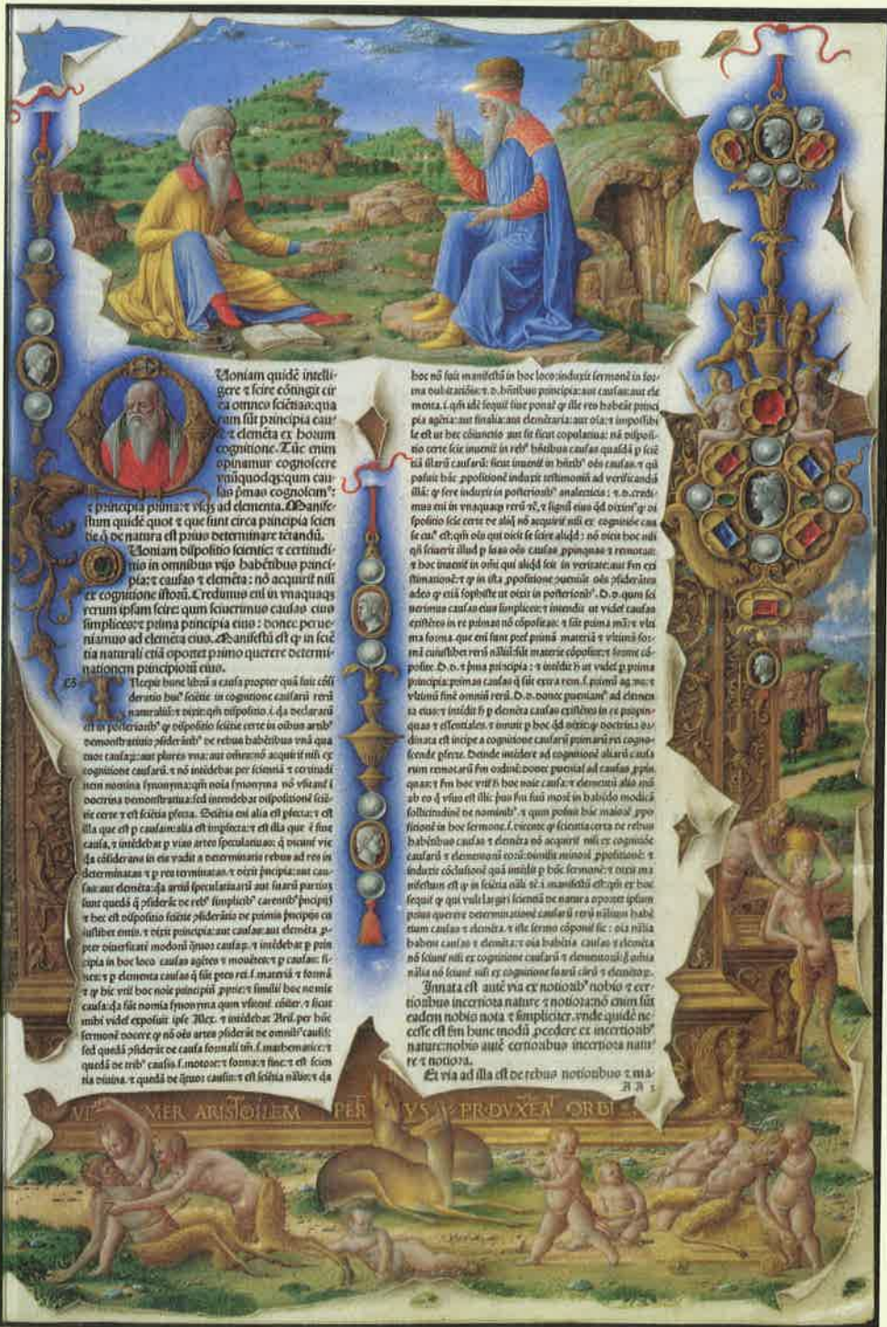
Source 12.3 Aristotle and Averroes

Illumination attributed to Girolamo da Cremona and assistants, Venice, 1483/The Pierpont Morgan Library/Art Resource, NY