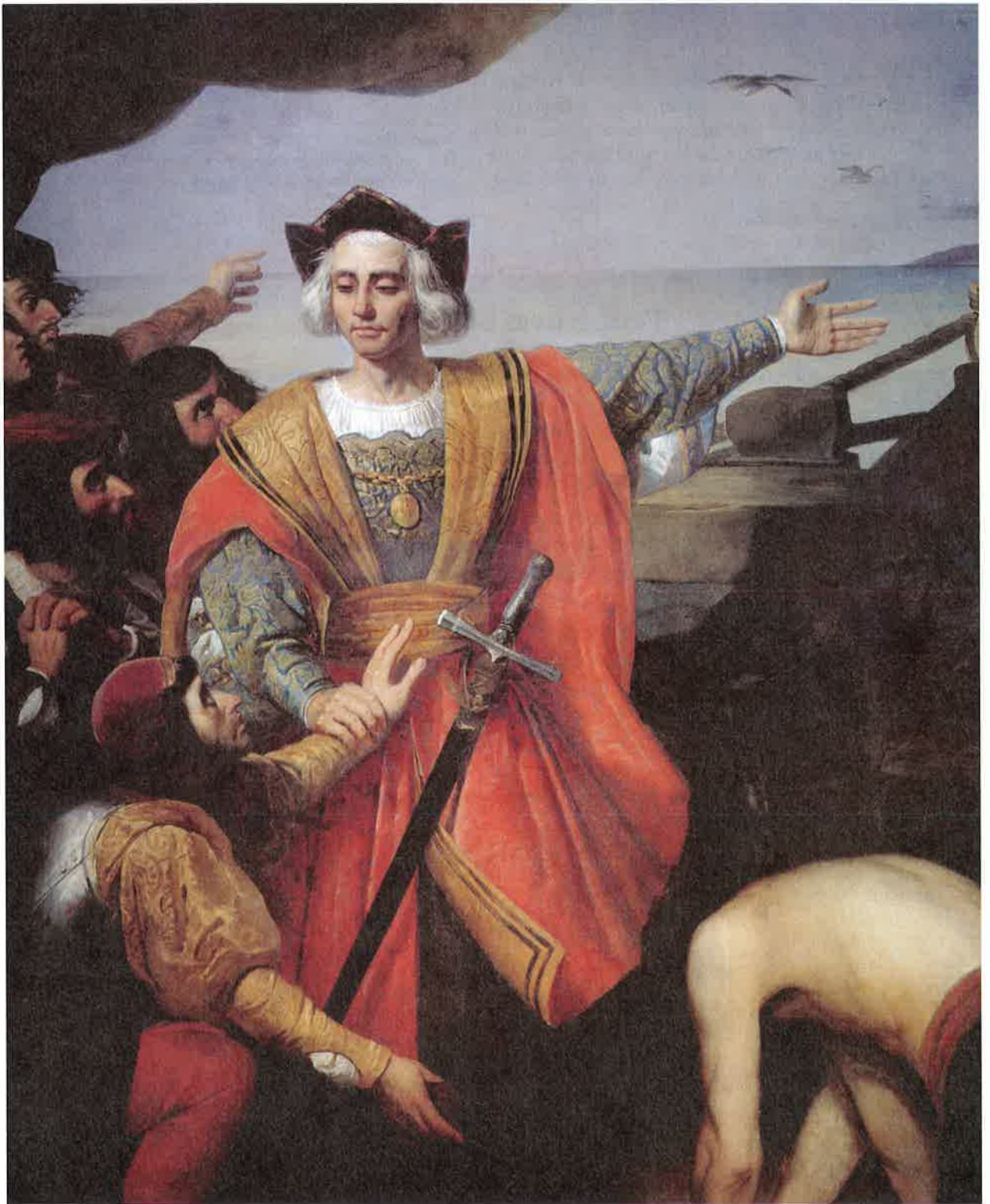
French painting, 19th century/Monastery of La Rabida, Huelva, Andalusia, Spain