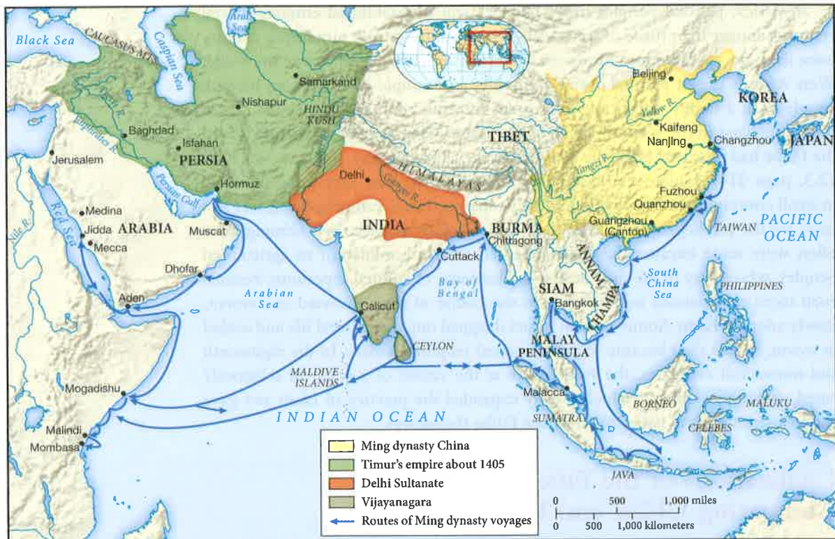
Map 12.1 Asia in the Fifteenth Century

The fifteenth century in Asia witnessed the massive Ming dynasty voyages into the Indian Ocean, the last major eruption of pastoral power in Timur's empire, and the flourishing of the maritime city of Malacca.