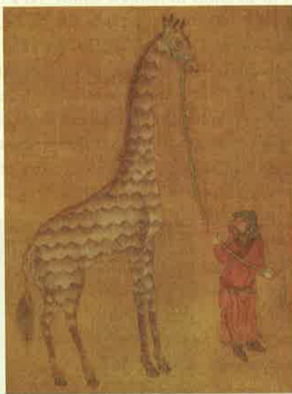
Among the acquisitions of Zheng He's expeditions, none excited more interest in the Chinese court than an African giraffe.

Zheng He's birth, as it happened, coincided with the end of Mongol rule. His own father was killed resisting the forces of the new Ming dynasty that ousted the Mongols from Yunnan in 1382. Eleven-year-old Zheng He was taken prisoner along with hundreds of Mongols and their Muslim supporters. But young Zheng He lost more than his freedom; he also lost his male sex organs as he underwent castration, becoming a eunuch. The practice had a long history in China as well as in Chris-