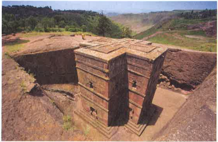
The Church of St. George, Lalibela, Ethiopia

In its isolated location, Ethiopian Christianity developed some of its most distinctive features. One of these was a fascination with Judaism and Jerusalem, reflected in a much-told story about the visit of an Ethiopian Queen of Sheba to King Solomon. The story includes an episode in which Solomon seduces the queen, producing a child who becomes the founding monarch of the Ethiopian state. Since Solomon figures in the line of descent to Jesus, it meant that Ethiopia's Christian rulers could legitimate their position by tracing their ancestry to Jesus himself. Furthermore, Ethiopian monks long maintained a presence in Jerusalem's Church of the Holy Sepulcher, said to mark the site where Jesus was crucified and buried. Then, in the twelfth century, the rulers of a new Ethiopian dynasty constructed a remarkable series of twelve linked underground churches, apparently attempting to create a New Jerusalem on Christian Ethiopian soil, as the original city lay under Muslim control. Those churches are in use to this day in modern Ethiopia, where over 60 percent of the country's population retains an affiliation with this ancient Christian church.