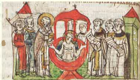
The baptism of Prince Vladimir.

that account, the prince essentially went shopping for a religion, sending emissaries to investigate the faiths of Judaism, Islam, Roman Catholicism, and Eastern Orthodoxy. Based on these reports, Vladimir rejected Islam, for it prohibited eating pork and drinking alcohol, and “drinking is the joy of the Russes.” Circumcision and the dispersal of the Jews from their homeland counted against Judaism, while the emissaries reported that they “beheld no glory” among the Catholics. It was a different story when they described Eastern Orthodox Christianity and the great church of Hagia Sophia in Constantinople. There, they declared, “we knew not whether we were in heaven or on earth.” And so Vladimir was baptized; married a sister of the Byzantine emperor; threw an idol of Perun, the god of thunder, into the river; and ordered the inhabitants of Kiev to