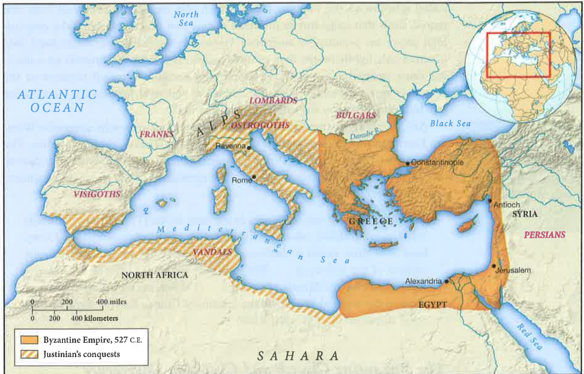
Map 10.1 The Byzantine Empire

The Byzantine Empire reached its greatest extent under Emperor Justinian in the mid-sixth century c.e. It subsequently lost considerable territory to various Christian European powers as well as to Muslim Arab and Turkic invaders.