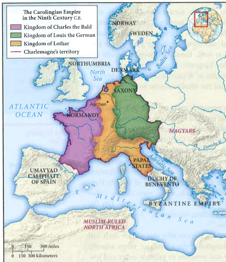
Map 10.2 Western Europe in the Ninth Century

much of Germany under his control, saw himself as renewing Roman rule, and was likewise invested with the title of emperor by the pope. Otto's realm, subsequently known as the Holy Roman Empire, was largely limited to Germany and soon proved little more than a collection of quarreling principalities. Though unsuccessful in reviving anything approaching Roman imperial authority, these efforts testify to the continuing appeal of the classical world, even as a new political system of rival kingdoms blended Roman and Germanic elements.